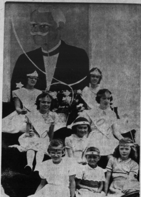
LOAT FEATURED HUGE PAINTING, PRETTY GIRLS

NIAGARA FINANCE COMPANY LIMITED Largest All-Canadian Consumer Loan Company