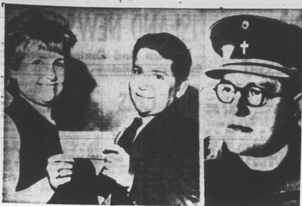
PRIEST AND REFUGEE MEET AGAIN