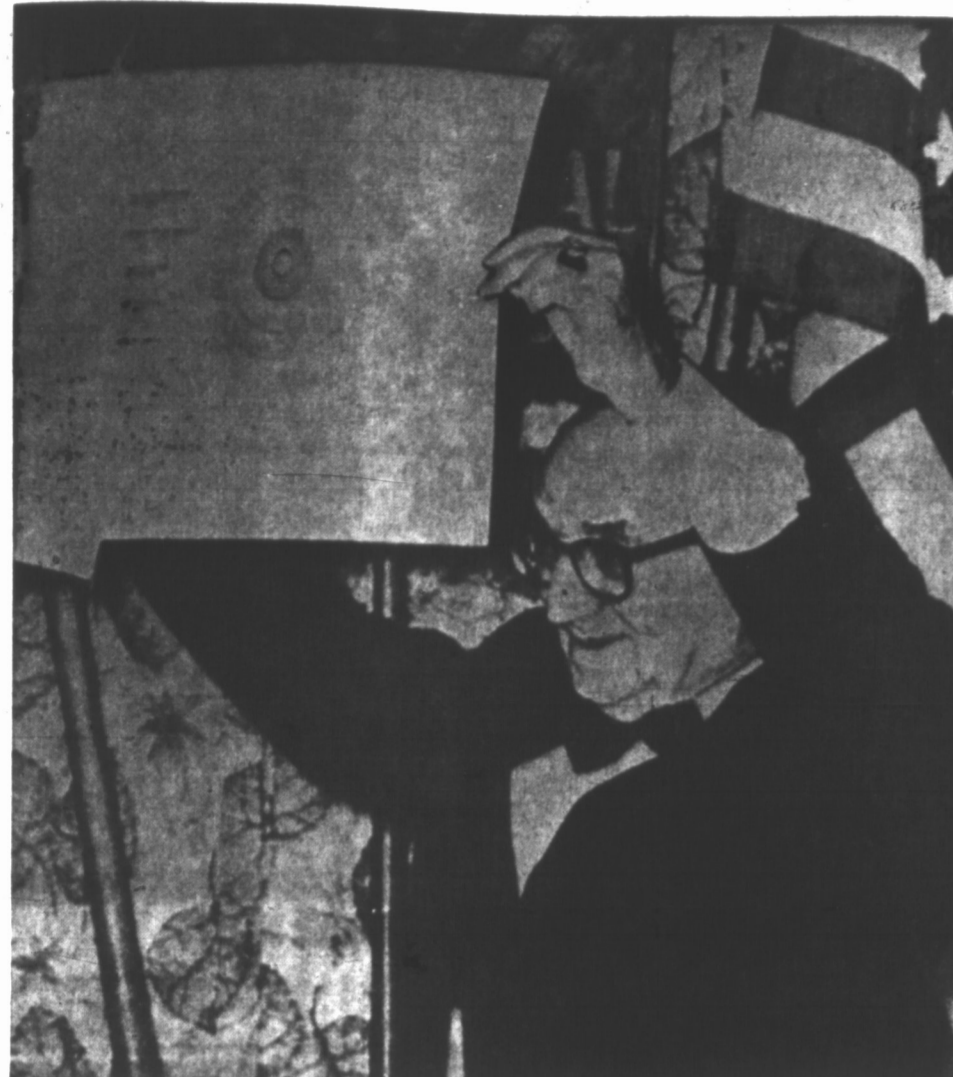
JOEY EXPLAINS ROUTE

Manitoba had the highest percentage of its population unable to speak either English or French—21 per cent or a total of 19,409 persons. That's about one in 50.