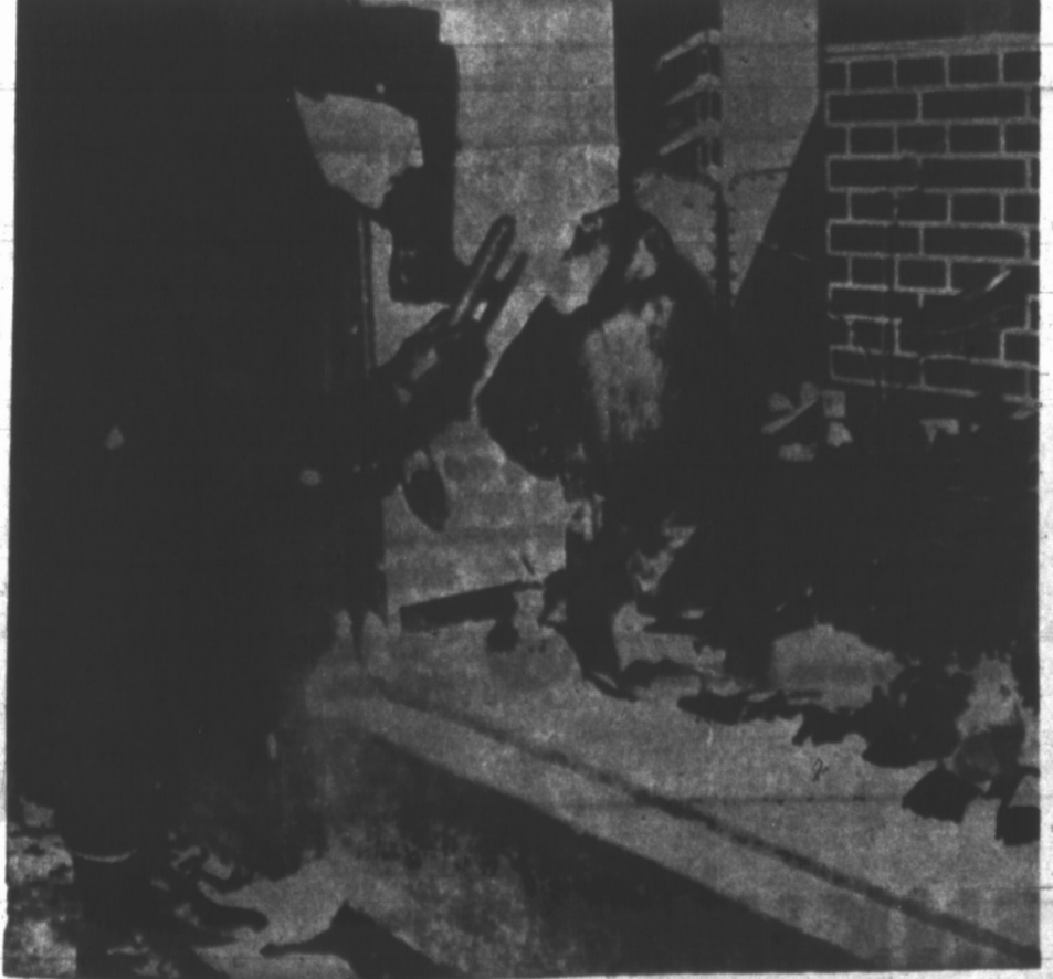
NOW LOOK HERE

MONSTER USED Bigger shovels — eight-yard electric monsters now are used — and trucks that weigh 25-35 tons are being seen more frequently.