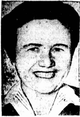
DR. CHARLOTTE WHITTON