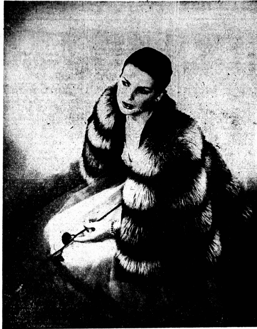
The beautiful fox cape shown above is to be presented to Princess Elizabeth today by Premier J. Walter Jones. It is made of skins which came from extra light, pearl platinum Prince Edward Island foxes and is a gift to the Princesses from the Island Government. There are only seven of these sapphire fox pelts in existence and four have been used to make this garment, described by its creators as a four tier cape, which has been named a Royal Sapphire Fox Cape in honour of the Princess. The cape was designed by the famous New York designer, Rifter, on request from Henry Morgan Co.