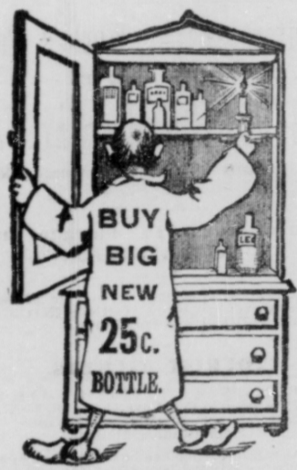
OK in the still night, When Cholera Morbus found me, "Pain Killer" freed me right, Nor weakened those around me.

Most OLD PEOPLE are friends of Perry Davis' PAIN KILLER