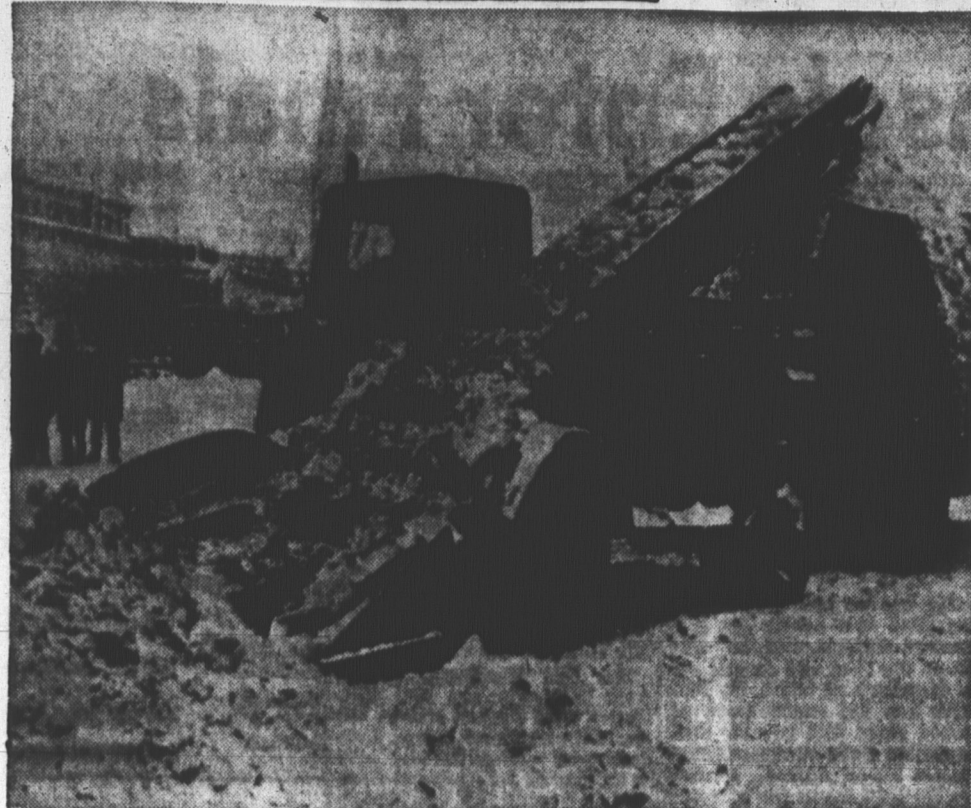
LOADING SNOW IN MOSCOW

Snow is scooped up by mechanical shovel and placed on Thursday at more than 10 1/2 inches of snow that has fallen since Sunday. In rear just to the left of the snow loader is Lenin's tomb and behind that is the Kremlin wall.