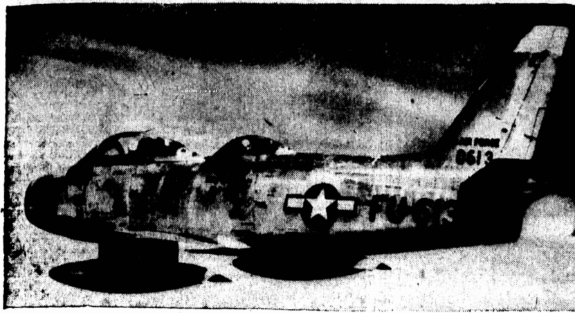
F-86 SABRE JETS CLOSER THAN SIAMESE TWINS Flying on an interceptor mission above the closer than Siamese twins. The close flying points waters of Nantucket Sound, Mass., two F-86 Sabre jets up the skill of U.S.A.F. pilots who ride the lifeline the U. S. 58th Fighter-Interceptor Squadron, are around the U. S.