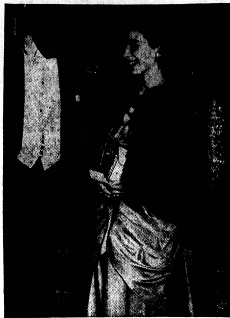
Before she left for Malta to holiday with her husband the Duke of Edinburgh Her Royal Highness attended many official functions. In this photograph she is seen as she recently was admitted a Member of the Royal Institution of Great Britain.