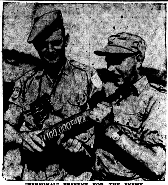
"PERSONAL" PRESENT FOR THE ENEMY