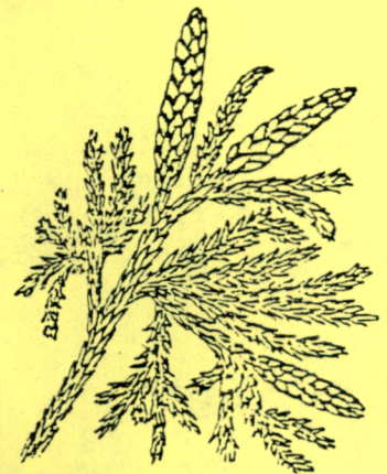
Fig. 3 Lycopodium obscurum L. Ground-Pine.

They do not bear flowers to produce seeds, but, like their neighbours and kinsmen, the Ferns, (these, too, have fallen from a high estate) they produce spores from