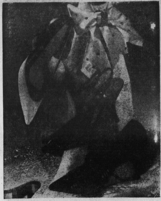
LATEST IN WOMEN'S SHOES

DAYTIME PUMPS Pumps for daytime wear feature understated lines, yellows and apricots, golden browns and browned blacks. Suede leather shoes are elegant in black and soft yet bright in white.