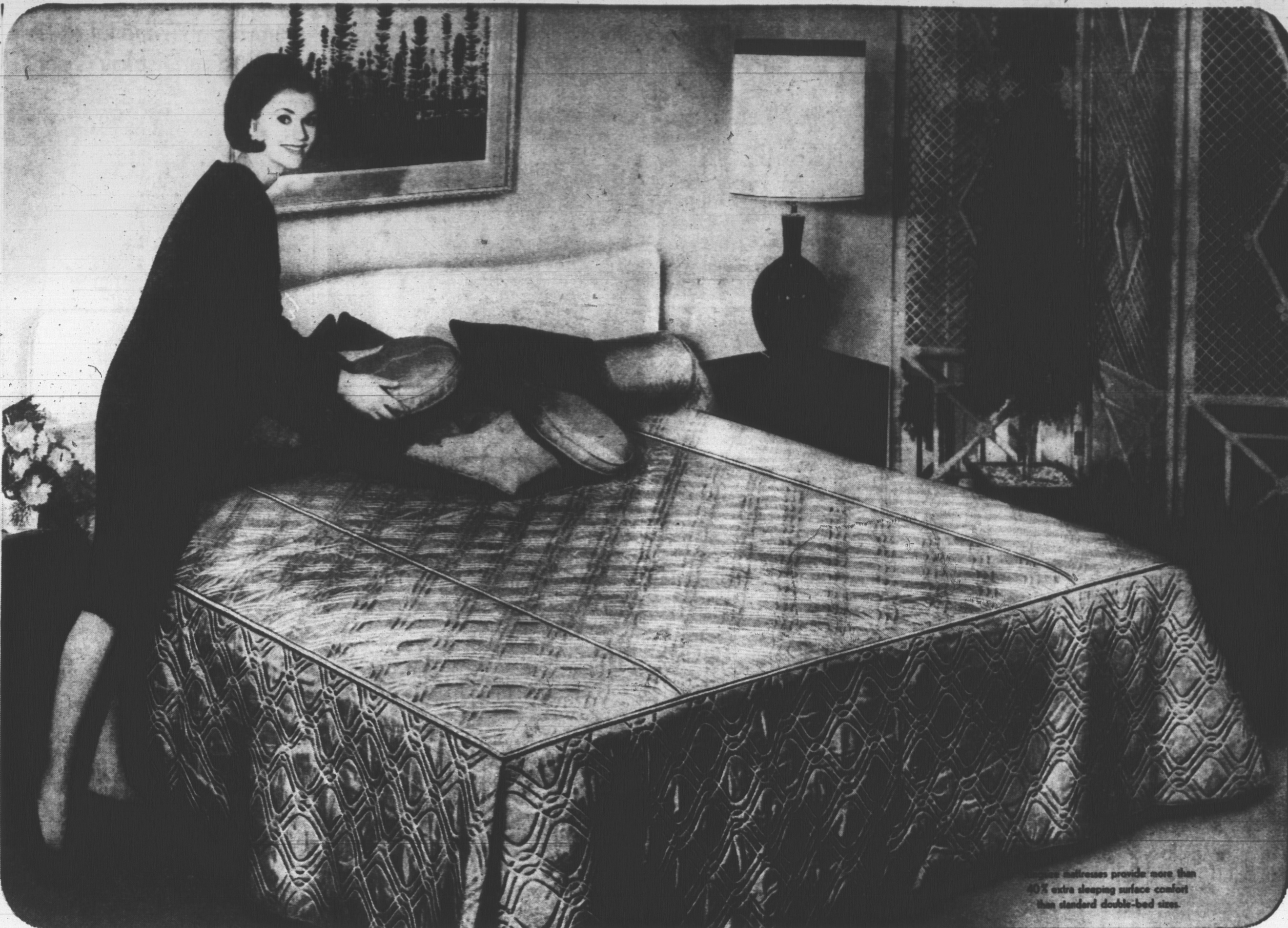
These mattresses provide more than 40% extra sleeping surface comfort than standard double-bed sizes.

WILL ASK INDEPENDENCE GEORGETOWN (Reuters) — British Guiana Premier Forbes Burnham will demand independence for the British colony as early as this fall or not later than next spring, he told a rally of his People's National Congress Sunday. Speaking in MacKenzie, 80 miles from here, Burnham said British Guiana could not become an independent country by copying Russia or the United States, he said.