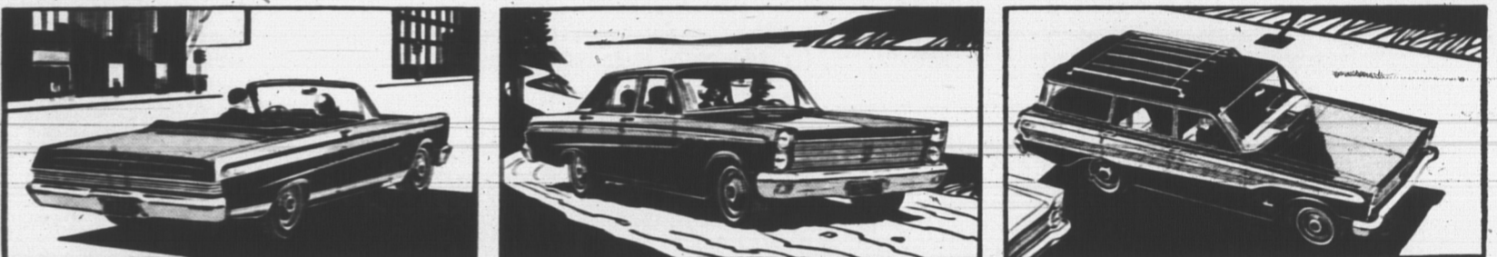
Comet Caliente Convertible is rich in luxury features which include, of course, a power operated top as standard equipment. Comet 404 Sedan — perfect for the economy-minded who want beautiful styling, wide choice of interiors, and superb performance. This Comet Villager is a standout with rich, mahogany coloured side panels, power rear window, 78.5 cubic foot cargo space.