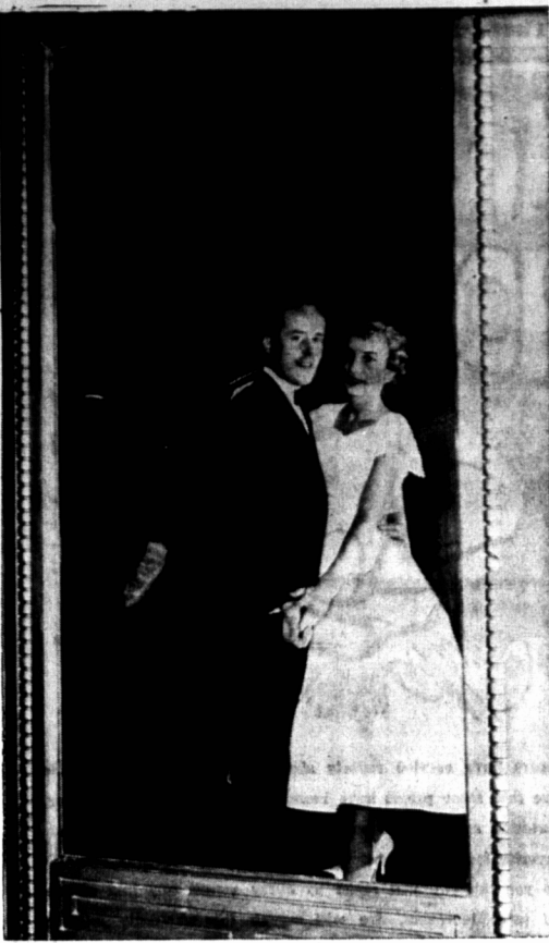
ENJOYING THE DANCE