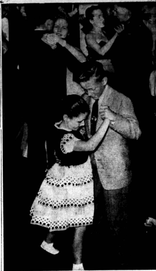
AT THE DANCE