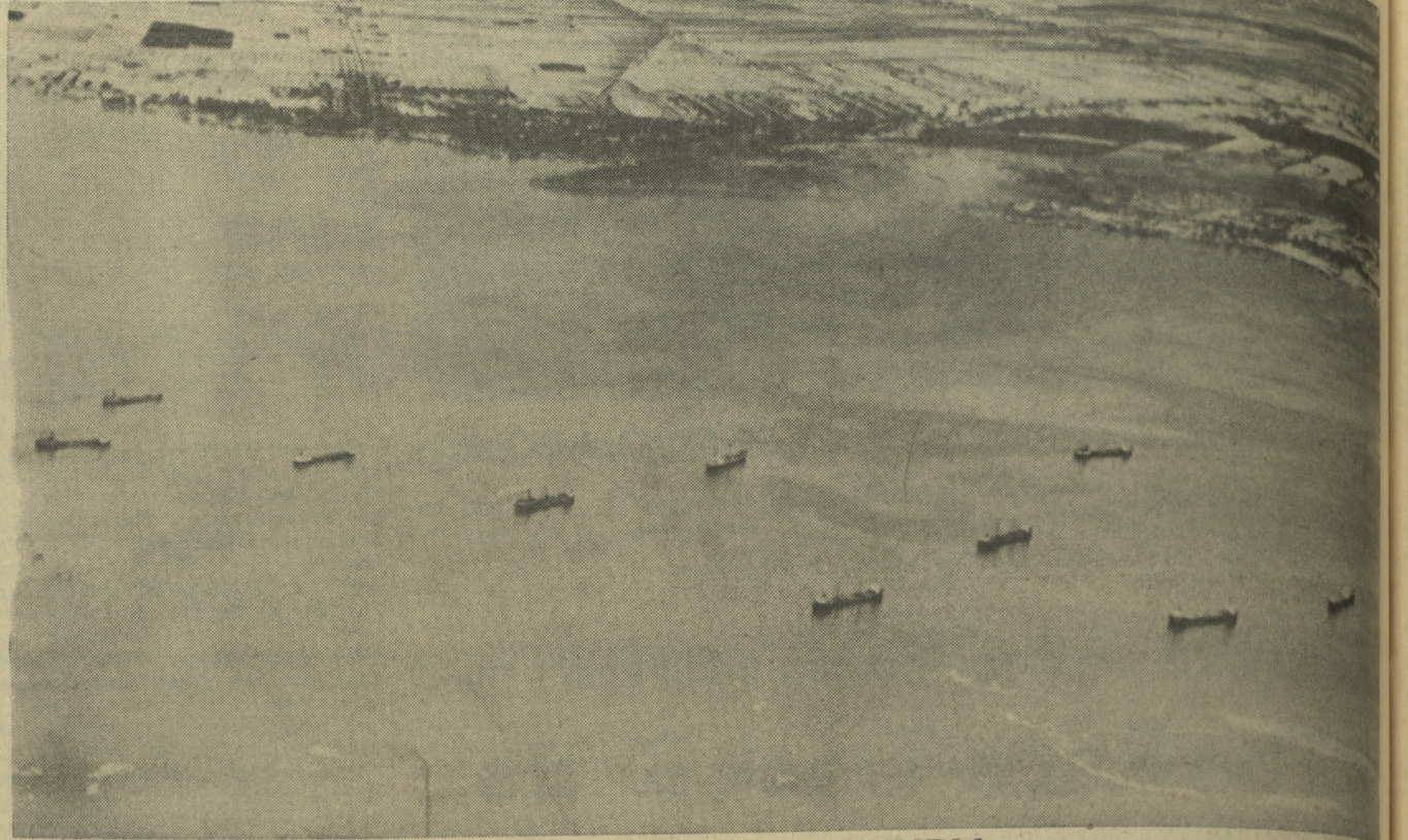
This aerial photo shows part of the fleet of 22 ships anchored on Lake St. Louis awaiting their turn to pass through theachine Canal to Montreal. Sunday the canal ship Selkirk became jammed fast - forming ice in the canal causing fears that a number of ships will be stuck for the winter in Lake St. Louis or the