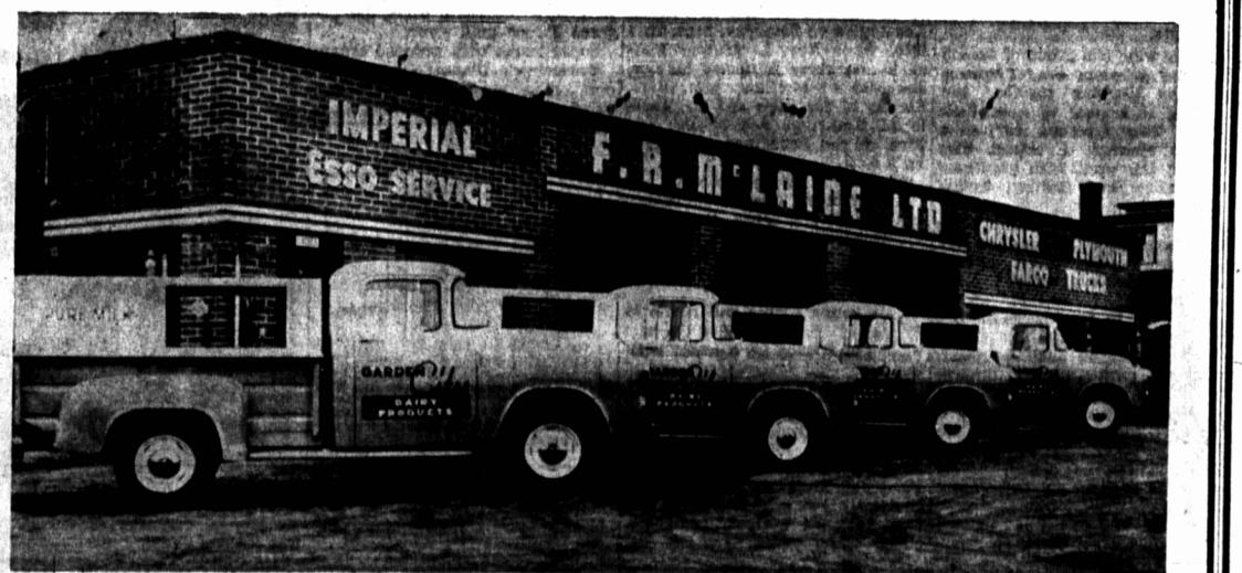
PURE MILK CO. LTD.'s NEW FLEET OF 1956 FARGO TRUCKS