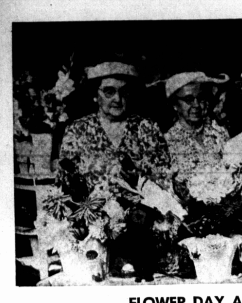
One of the annual projects carried out by the ladies of the Parkdale Women's Institute is a gift of flowers to the patients and staff of the Provincial Sanatorium.