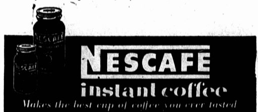
Nescafé (pronounced NES-CAPAY) is the exclusive registered trade mark of Nestlé (Canada) Ltd. Nescafé is a soluble coffee product which is composed of equal parts of pure soluble coffee and added pure carbohydrates (dextrin, maltose and dextrose) added solely to protect the flavour.

No other coffee, instant or ground, gives you the richer flavour of Nescafé