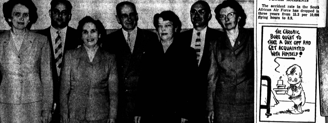
PICTURED ABOVE are the members of the new executive of the P.E.I. Music Festival Association who were elected to office at last night's meeting held at