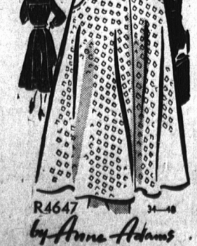
R4647 by Anne Adams

NOTTINGHAM, England. (CP) — While summing up the day's cases at a juvenile court, an official estimated it cost more to send a delinquent to a special school than it would to send him to college.