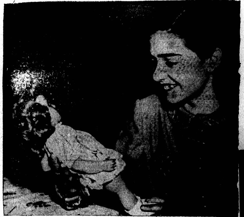
Music circles in Europe are agog over Anna Maria Alberghetti, who at the age of 13 seems to be well on her way to fame as an operatic soprano. She made her debut on concert stage in 1943 at the age of seven. This Italian girl had a brief North American tour in March.