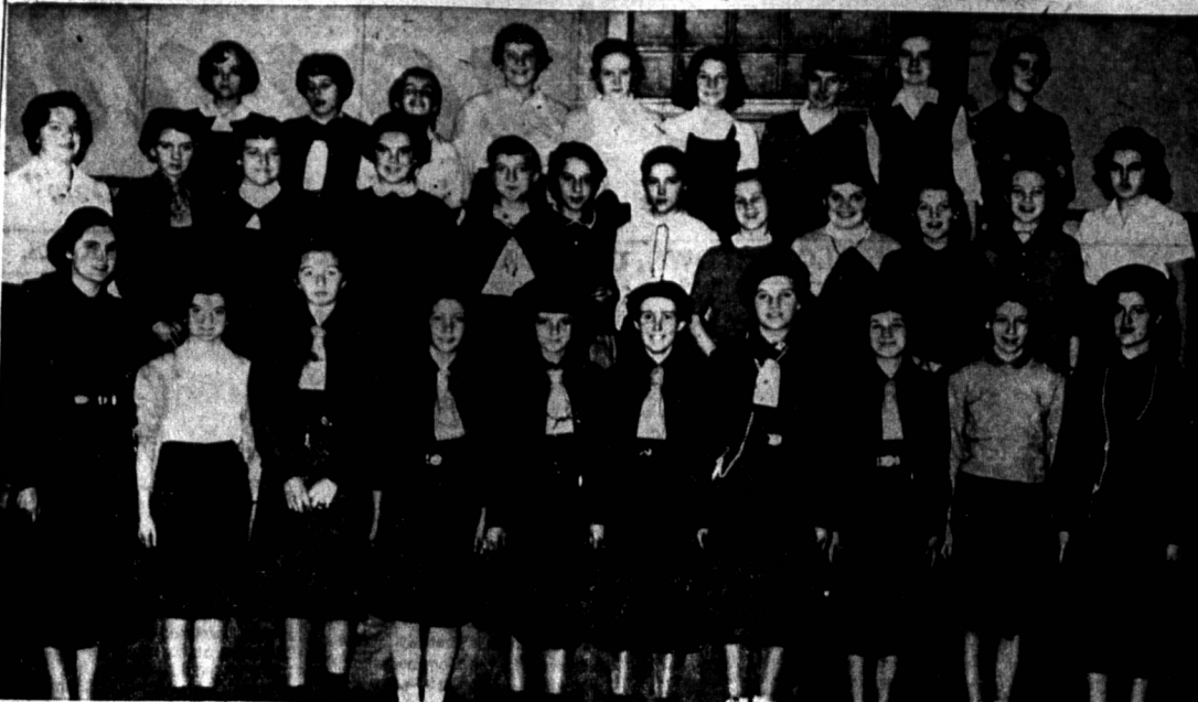
GIRL GUIDES of 5th Charlottetown Company, Holy Redeemer Parish which was organized on Oct. 3, 1956, were enrolled last night.