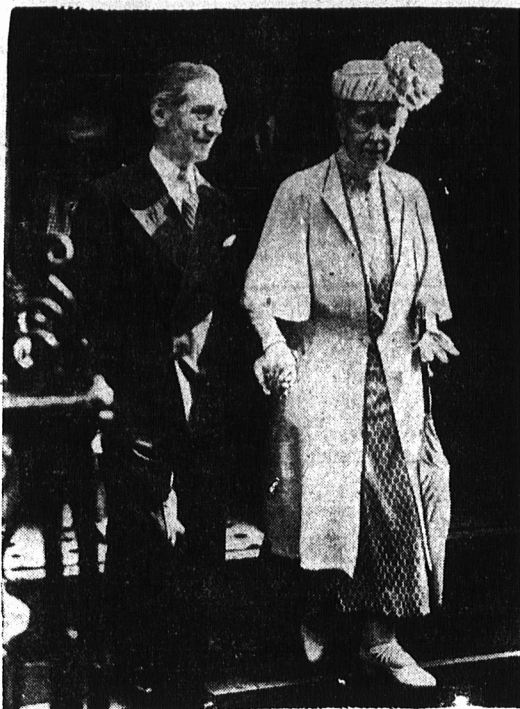
DOWAGER QUEEN ENJOYS FAVORITE PASTIME

These physicians suggest careful study of the nervous element in these headaches due to tension. This study will be found most worthwhile in many types of headache including headaches due to high blood pressure, headaches following head injuries, sinus disturbances and other headaches.