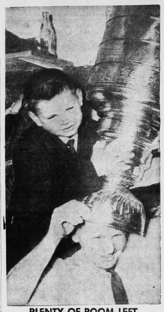
PLENTY OF ROOM LEFT

"I've been around a long time waiting for something like this, said the former New York Ranger. "I didn't know I would take a trade to get me to the cup celebration but I couldn't be happier. This is."