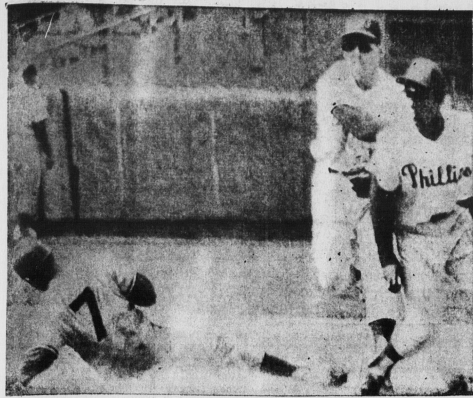
FORCED OUT AT SECOND