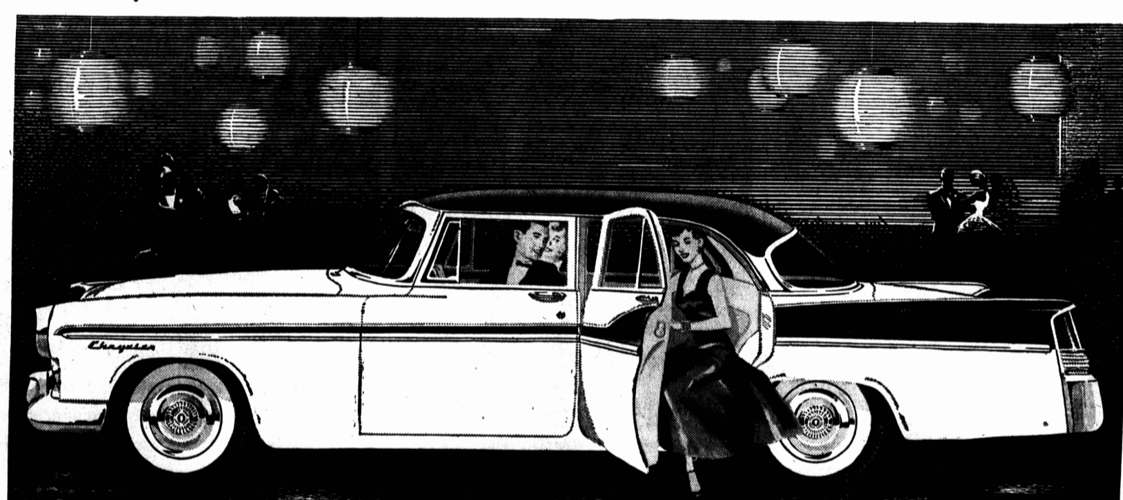
CHRYSLER WINDSOR 4-DOOR SEDAN

Easier than ever to admire...and own! Chrysler WINDSOR