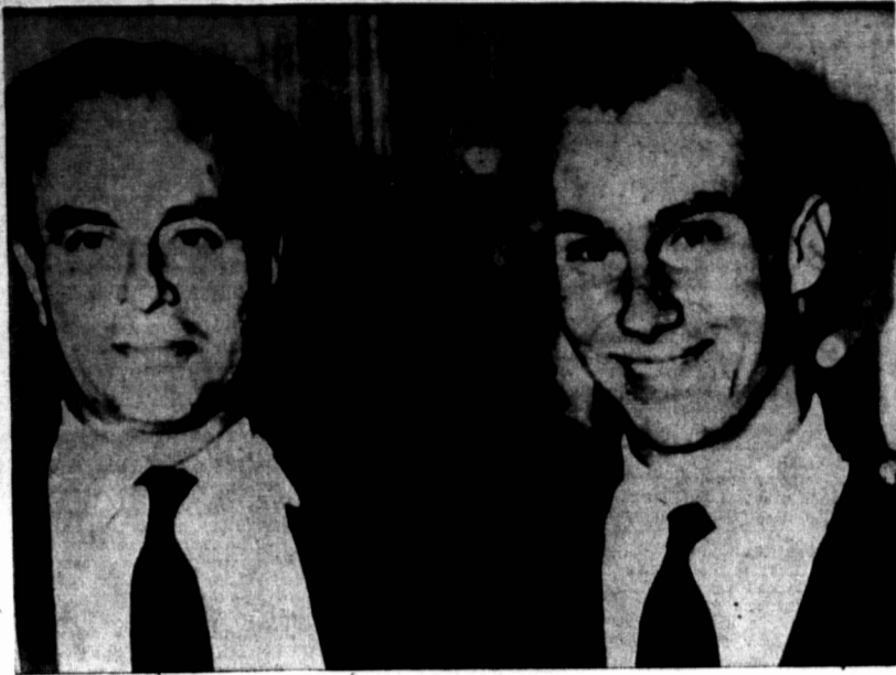
TELLS SON HE IS AGA KHAN

Prince Aly Khan looks the part of a proud father as he stands with his son, Prince Karim in Geneva today after the announcement that Karim had been named by the late Aga Khan to the throne as leader of the Ismaili Moslems. The handsome 20-year old prince is the elder son of Prince Aly and his first wife. He will be known as Aga Khan I.