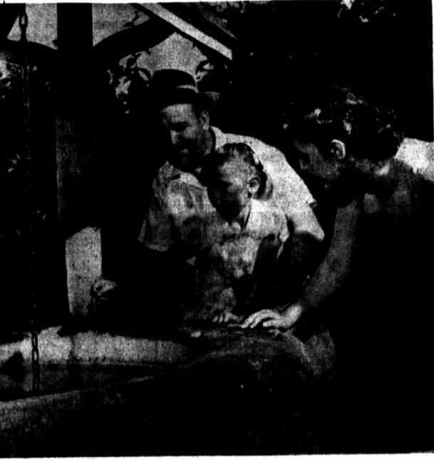
Irresistible to all is the 19th century wishing well. The money thus collected amounts to about $300.00 a year and is turned over to the Red Cross. Here one of the hopefuls of the world makes that all important wish.