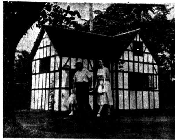
Ye Olde English Inn is the place to sign the visitors book. Built in Elizabethan fashion, it is the only building large enough to enter. However, don't expect the Boar's Head or other traditional fare.