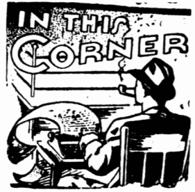
IN THE CORNER

has been knocked out in 47 fights as a pro since 1949. He has 43-2-2 record, losing only to Gil Turner and Del Flanagan last year. The bout presents one unique angle. Saxton, convicted of 12 traffic violations in New York as a "speeder," is booked to start serving a 15-day jail sentence the day after the fight, champ or no champ. Gavilan gets 40 per cent and Saxton 20 per cent of the gate and TV, according to the contracts.