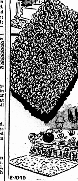
DESIGN NO. E-1048

Crocheted scatter rugs are ideal items of pick up work for evenings. They may be made from cast off cotton, silk or woolen materials cut in strips. Pattern No. E-1048 contains complete instructions. To order, send 20 cents in coin to Needlework Bureau, Charlottetown Guardian, Design No. E-1048