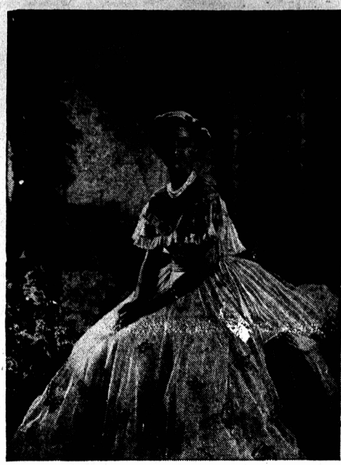
Princess Margaret who is a cellor of the Exchequer, sat side by side. But a lot of other people were there too. The Princess wore an off-the-shoulder picture gown of tulle, and she had several dances, one with the Sadler's Wells star, Robert Helpmann.