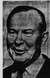
Lester B. Pearson