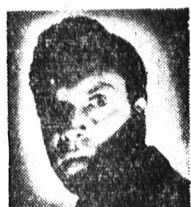
MAL... who thought he could outsmart the Syndicate—and its women. And didn't think a bullet could catch him.