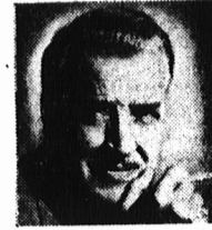
CARL... ruthless ruler of the Syndicate—who couldn't stand the sight of violence. That was for hired hoodlums.