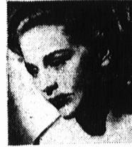
TRUDY... who liked all the pretty money—till it began to have a peculiar smell.