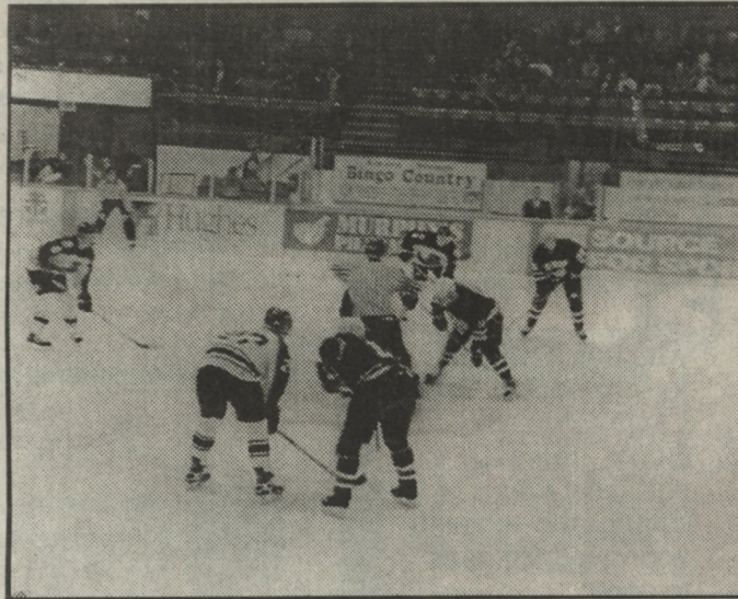
Concentration. The players prepare for a face off.