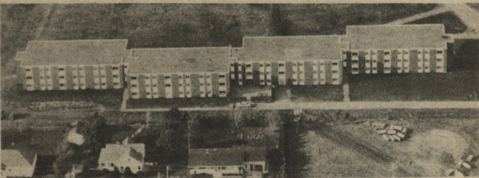
AERIAL VIEW OF BLANCHARD HALL FACING BELVEDERE AVE.