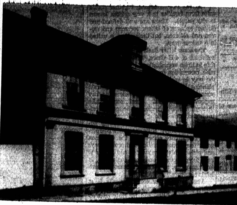
First Charlottetown Hospital opened in 1879. From Dorchester Street it was removed to the corner of Dorchester and Haviland streets and remodelled into a double residence.