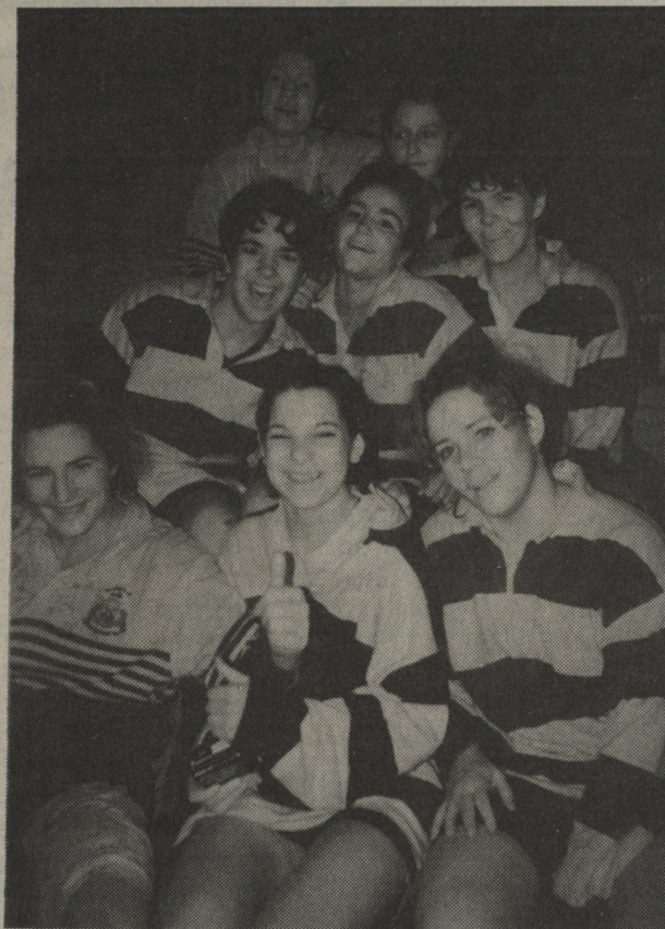
Above: Women's division winners, the PEI Selects.

On a closing note there's touch rugby at the Sports Centre Friday afternoons- if your interested just turn up! Well, I guess that's a wrap for rugby until the summer league starts in June- see ya there!