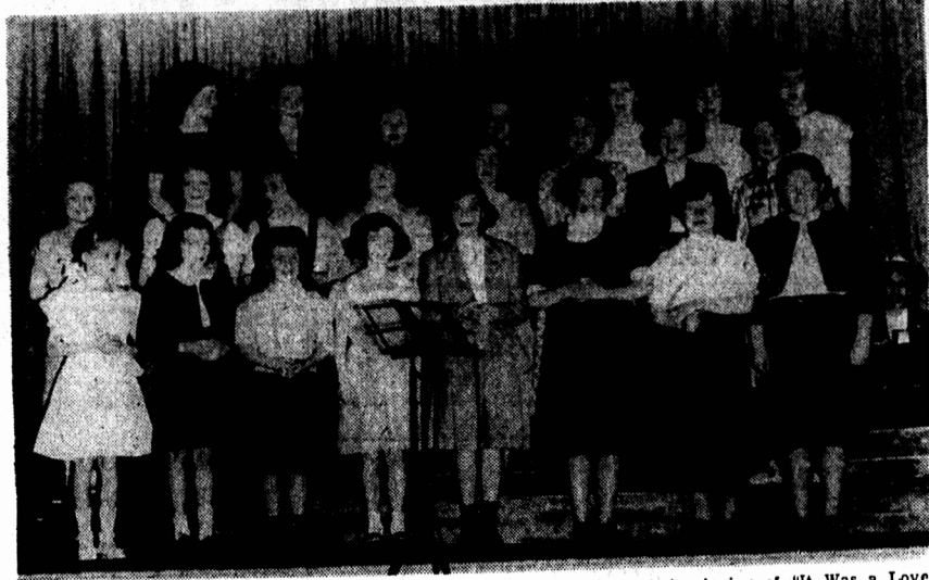
Pictured above is the Kirk Girls Gallery Choir of Charlottetown, winner in class 23 of the recent Festival of Music. The Kirk Choir received marks of 85 and 83 for their singing of "It Was a Lover and His Lass" and "Cradle Song", winning first place over the three other contestants.