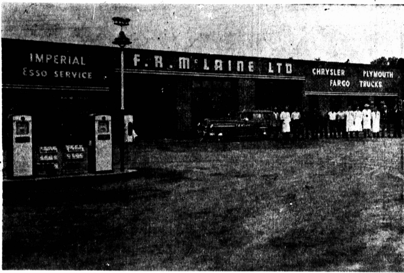
The F. R. McLaine Ltd., Service Station, Garage, Showroom, Parts and Accessories Department and Offices located on the Malpeque Road.