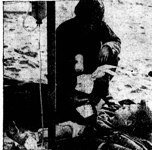
MAIL (AND BLOOD) CALL — A wounded Marine, receiving a plasma transfusion, calmly reads a letter from home as a first aid man works over him on the Korean front.