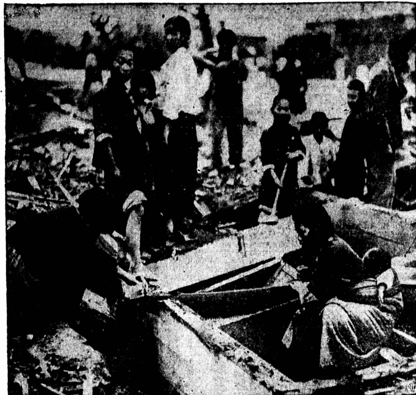
SO YOU THINK YOU HAVE A HOUSING PROBLEM? — There's no day nursery in war-blasted Wonsan, Korea, to park junior while mamma gets on with her task of rebuilding their wrecked home. So this Korean baby, strapped to its mother's back, gets a rough ride as she helps her companion saw up part of the house frame for rebuilding.