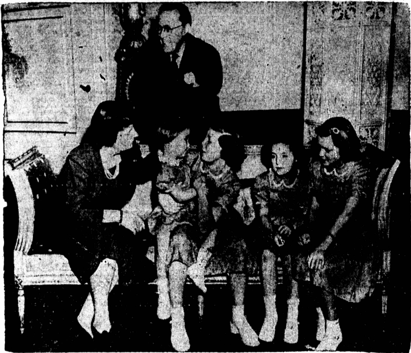
Queen Juliana of the Netherlands poses with her four daughters and her consort, Prince Bernhard, in a recent family portrait made at the Dutch royal palace in the Province of Utrecht. The four princesses are: Maryke, left, Beatrix, Margaret and Irene.