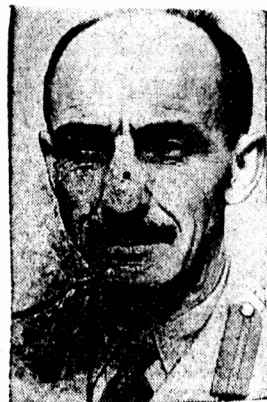
The nation's multi-million dollar defence program has started to hit the labor market, reports the Hon. Mr. Milton F. Gregg, minister of labor. He said the search was on for more machinists, welders and other experienced metal tradesmen to keep Canadian industry rolling at top speed and that demand was "strong" and increasing. Typical of the type of orders now being placed and providing new jobs for Canadians was a $3,000,000 order for 5,000 steel box-cars ordered by the Canadian National Railways from three Canadian companies.