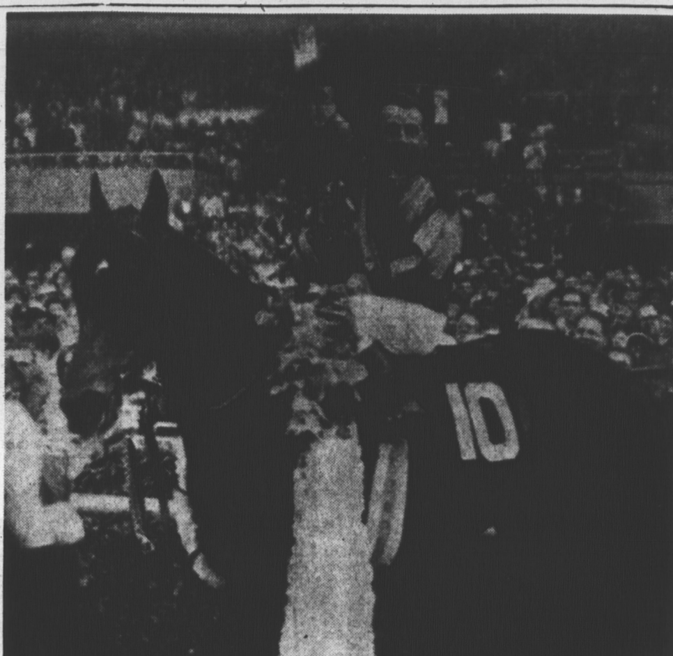
WHAT A FINISH

Both players are at the Rio Pinar Country Club, Orlando, Fla., where the $100,000 Florida Citrus Open begins Thursday.