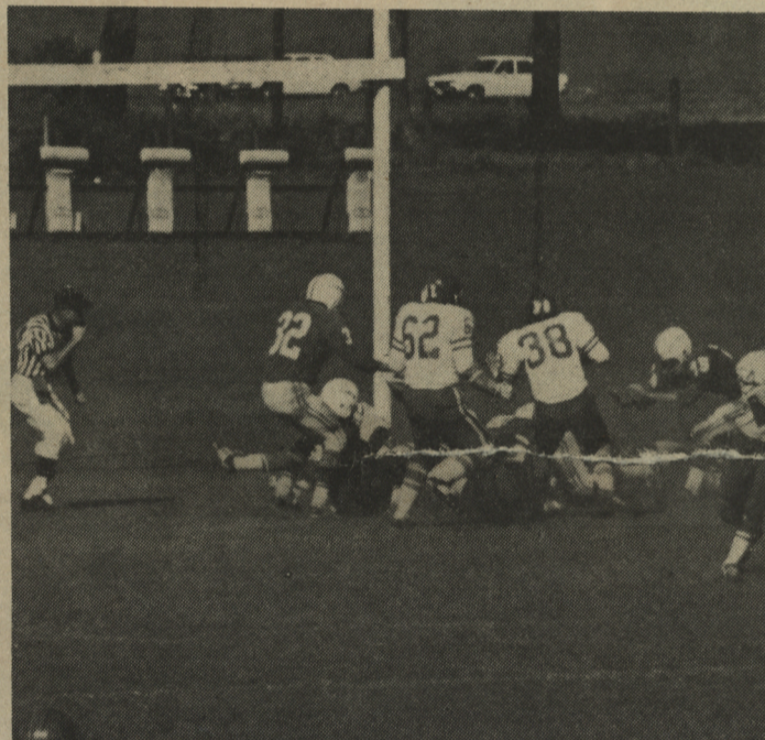
The Cadre , Oct. 4 page 11