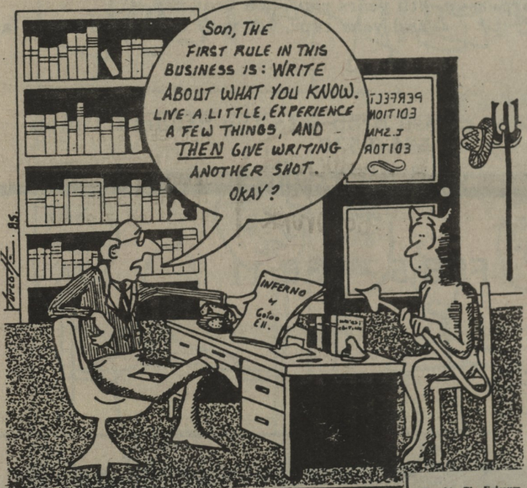
Graphic: The Fulcrum