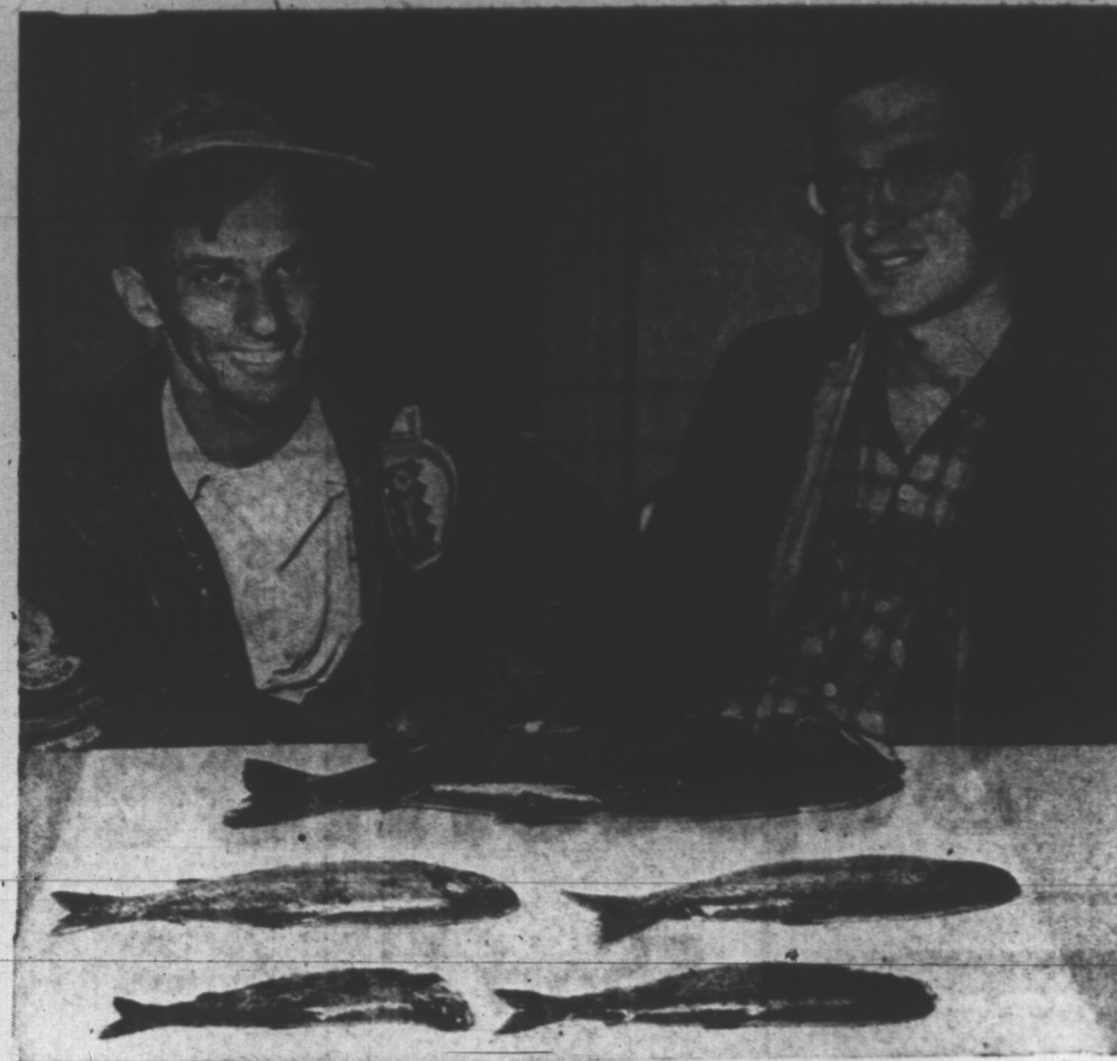
DUNK RIVER YIELDS GOOD CATCH

most inexpensive salesman you can employ - a GUARDIAN - PATRIOT WANT AD Phone 8506 Newfoundland Canada Steamships Limited Halifax 3-8241 Charlottetown Agents BUNTAIN, BELL & CO. Dial 5424