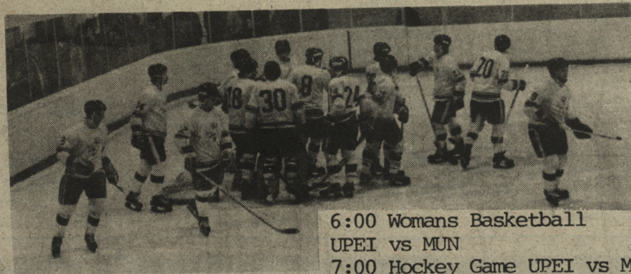
6:00 Womans Basketball UPEI vs MUN 7:00 Hockey Game UPEI vs MUN Noisemaker Night