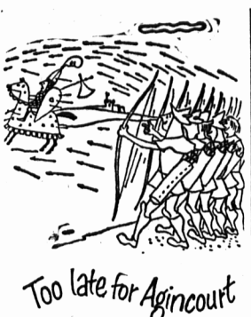
Too late for Agincourt

big stone rolled down the hill and hit him in the back, so that the bones of his legs turned to water. Men found him the next day in the plantation, where he had pulled himself with his hands, and they brought him to his fale. But he told no one about the great drum — only me, he told when I am M'fani. So he is not like other men, for he lies on his mats all day and never comes out of his fale. But all men know that he is more wise than anyone, and if he likes this thought of yours, they will do all that you say." This was a complication he had not foreseen, for he had not realized how much influence this old fellow exerted in the community. Indeed, he had not known of his existence till M'fani had spoken of him on the previous afternoon. "Well, in that case, perhaps, I'd better go down and see him myself," he said rather doubtfully. M'fani shook her head decidedly. (To be Continued)