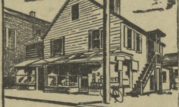
THE FIRST SUNDAY SCHOOL IN AMERICA Fowtucket, R.I. SUNDAY SCHOOL CLASSES WERE STARTED BY INDUSTRIALIST SAMUEL SLATER AFTER HE OVERHEARD SEVERAL SMALL BOYS DISCUSSING PLANS TO ROB A FARMER'S ORCHARD (1793)

PRINCE KAUNITZ The Austrian Chancellor WAS SO SENSITIVE TO DRAFTS IN HIS OFFICE THAT HE ALWAYS WORKED WITH A GLASS BOWL OVER HIS HEAD