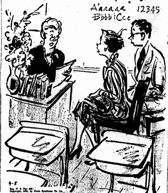
"Is it important that he learns so much about reading? He's going to spend most of his life watching television."