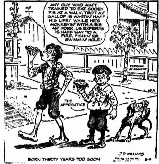
Out Our Way