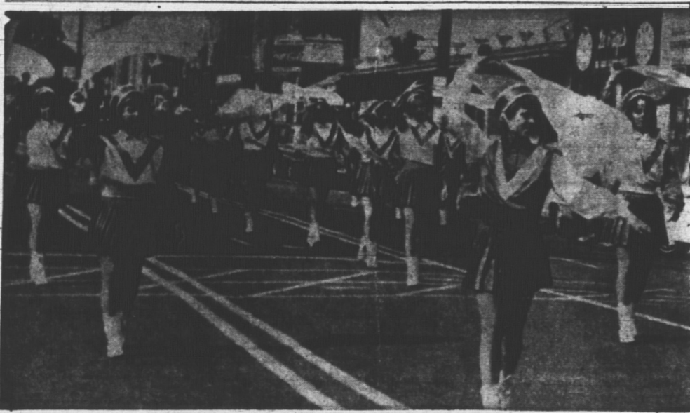
MAJORETTES WILL PLAY BIG ROLE

Gifts . . . Souvenirs Galore . . . During Gold Cup and Saucer