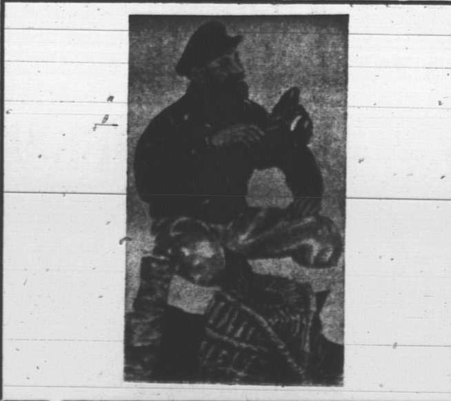
Lobster Man as shown 7 1/2" at 26.25 Other Figures from 10.50 up

Teapot, Sugar and Cream plus Cup and Saucer. 3 PIECE TEA SERVICE . . . $11.25 Other Pieces priced from . . $2.50