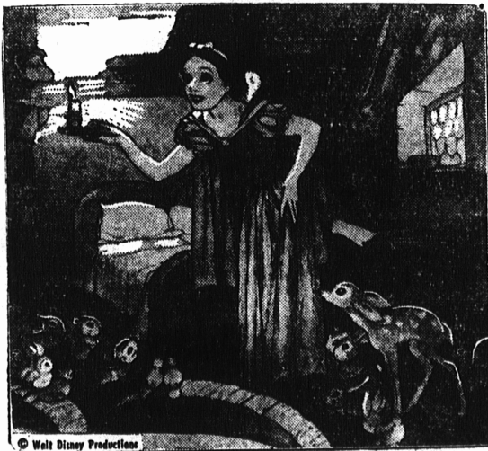
GUEST. The beloved heroine of Walt Disney's re-issued "Snow White and the Seven Dwarfs" find hospitality in the home of the dwarfs and their woodland friends.

High drama, pathos, excitement and music are woven into Walt Disney's feature-length production, the famous "Snow White and the Seven Dwarfs" which is now being welcomed back to the screen to repeat its triumphs of several seasons ago. The story is that of the oppressed heroine of the Grimm Brothers' fairy tale, of whose beauty the Queen is so jealous that she retreats to her dungeon laboratory to brew spells against Snow White. Then in the guise of a Witch, she makes a victim of Snow White after tracing her to her refuge among the hospitable Seven Dwarfs. Excitement becomes redoubled when the dwarfs (Dopey, Sleepy, Grumpy, Bashful, Happy, Sneezy and Doc) chase the Witch into the mountains where, just as she is about to roll a great boulder down upon them, a bolt of lightning takes care of the situation. The Dwarfs, believing Snow White is dead after her experience with the Queen, build a glass coffin for their friend, small animals and birds taking turns guarding it. But romance comes along in the person of a young Prince. He kisses Snow White, breaks the spell, and the two ride away to happiness. All the original hit songs, remain in this big feature production which is re-released via RKO Radio and in color by Technicolor. The numbers are: "Some Day My Prince Will Come," "Snow White," "I'm Wishing," "Whistle While You Work," "One Song," "Heigh-Ho," "The Dwarfs' Yodel Song," "Bluddle-Uddie-Um-Dum" and "With a Smile and a Song."